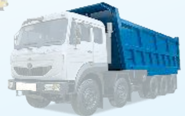
Tata Motors Tipper Body