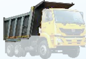
VECV Tipper Body