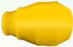
Cement Mixing Drum