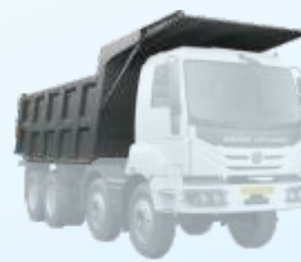
Ashok Leyland Tipper Body