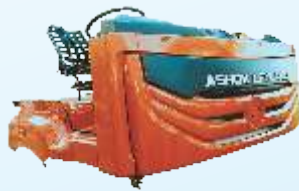
Half Cabin BSVI