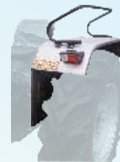
Fender / Wheel Arch